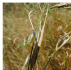
SPURRED SPEAR GRASS Austrostipa gibbosa