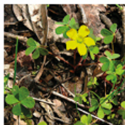
NATIVE SORRELL Oxalis perennans