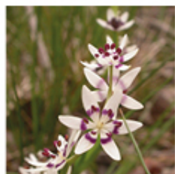
EARLY NANCY Wurmbea latifolia

Can you see any of these plants as you walk through the grasslands? Mark them off on the checklist at the end of this booklet.