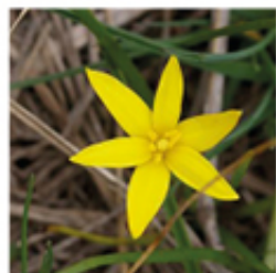
TINY STAR Pauridia glabella