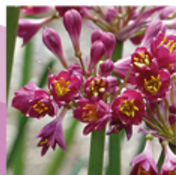
PINK GARLAND LILY Calostemma purpureum