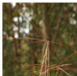
WINDMILL GRASS Chloris truncata