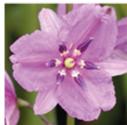
CHOCOLATE/ VANILLA LILY Arthropodium sp.